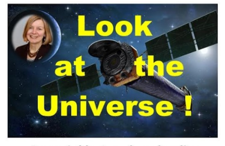
A special lecture by a leading astrophysicist from USA

Pre-lecture reception on 29 APRIL at 1800 . Entry Donation £15 . Tickets available from Blue, Broad Street, Pershore or email <u>tickets@fopa.co.uk</u>