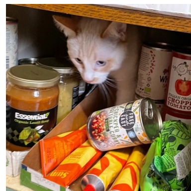
Banksy sorts through the store cupboard

Thanks to the incredible generosity of our donors we are no longer asking for donations of dog food!