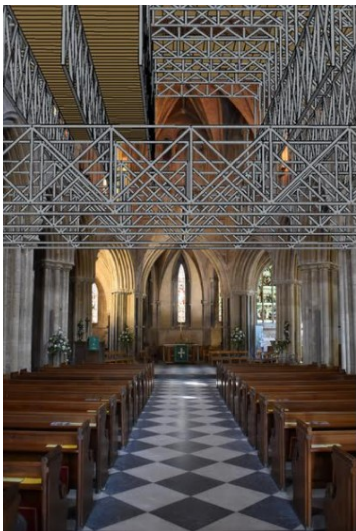
Visualisation of scaffolding in situ during the organ installation

We are naturally delighted that this exciting organ project is shortly to be realised and look forward to the benefits that this new, powerful and versatile instrument will bring to the Abbey congregation and the wider community for generations to come.