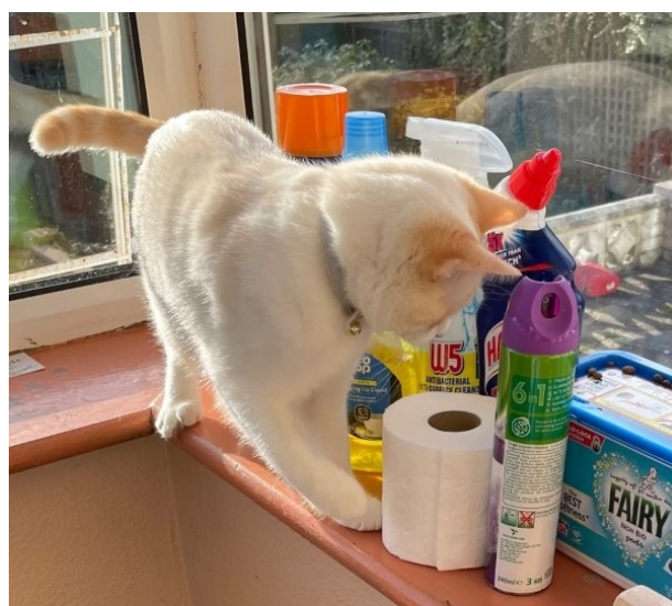
CTiP Foodbank Mascot "Banksy" with his donations of household cleaning products