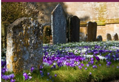
ST JAMES', BIRLINGHAM

BULB SERVICE RETURNS TO BIRLINGHAM: Join the congregation at St James', Birlingham on Sunday 20 February at 1500 as they celebrate new life bursting forth in their beautiful Bulb Sunday service.